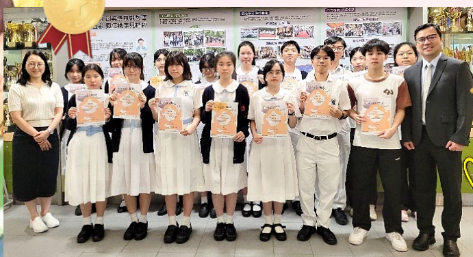
青協「好義配」義工嘉許計劃 2024/25 團體嘉許金獎：廖寶珊紀念書院義工組